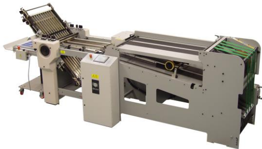
BAUM 20 CFF

We have retained the same proven features of the previous model including: