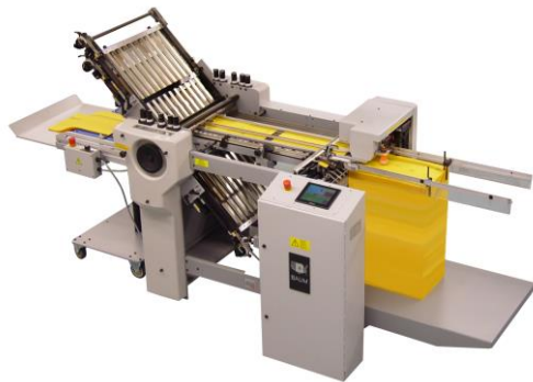
BAUM 20 PFF

The Baum 20 PFF & CFF Models contain many new and unique features that were not found on the previous generation of Baum 20 Floor Model Folders.