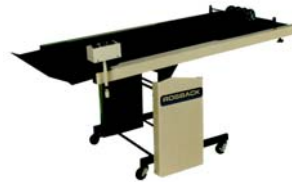
Optional Conveyor Delivery