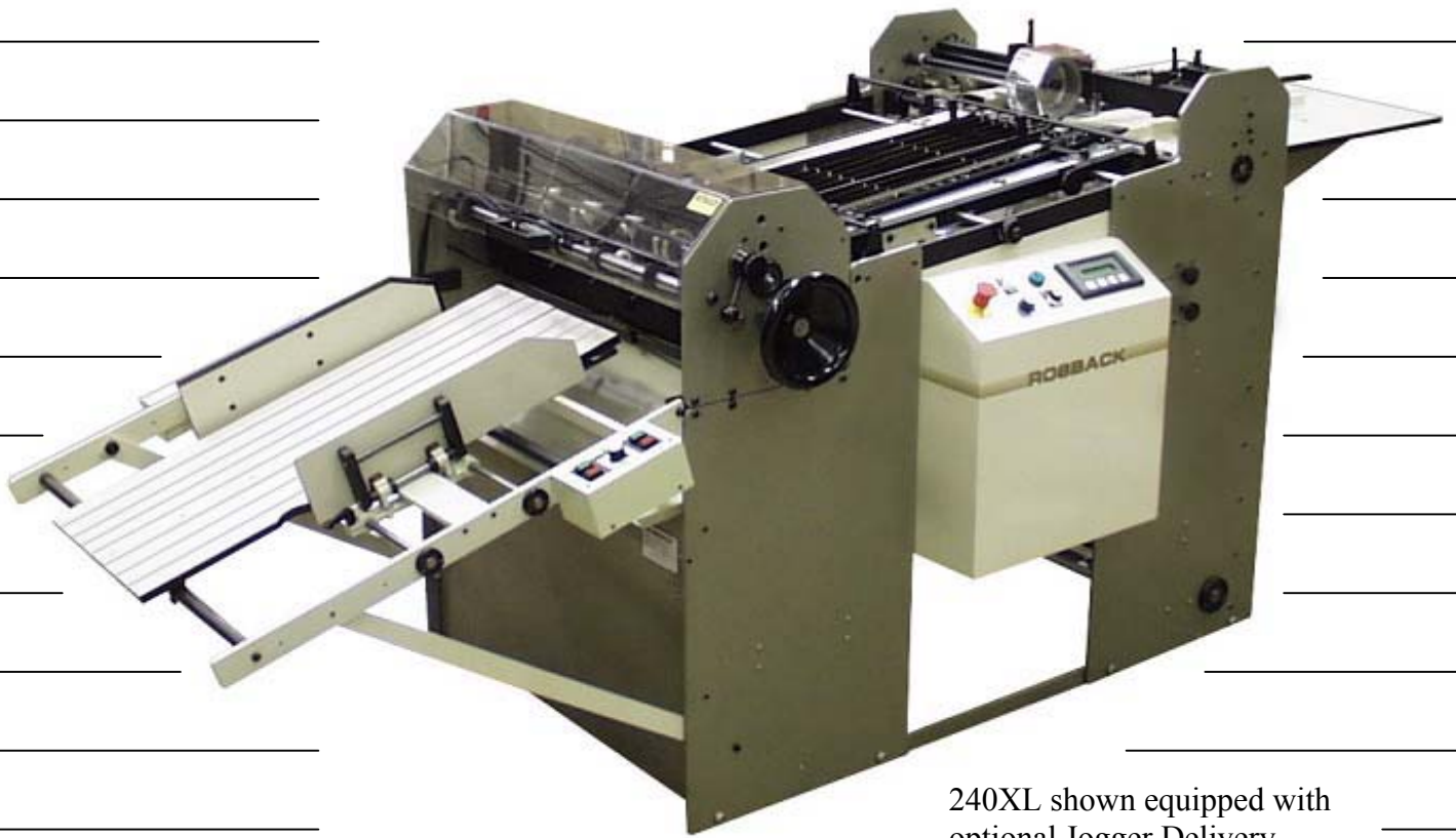
240XL shown equipped with optional Jogger Delivery