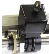
Optional Strike Perforating