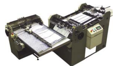
Optional 248 Right Angle